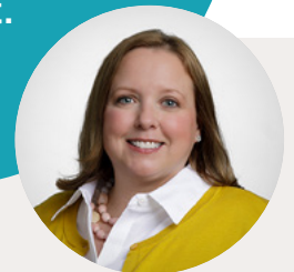
Heather Patient Support Services

We believe every person living with ALS deserves personalized support—and we are determined to deliver it.