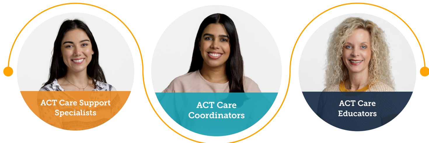
ACT Care Support Specialists

You'll get to know the ACT™ team as people who are deeply dedicated to your well-being, providing personalized support throughout your treatment journey.