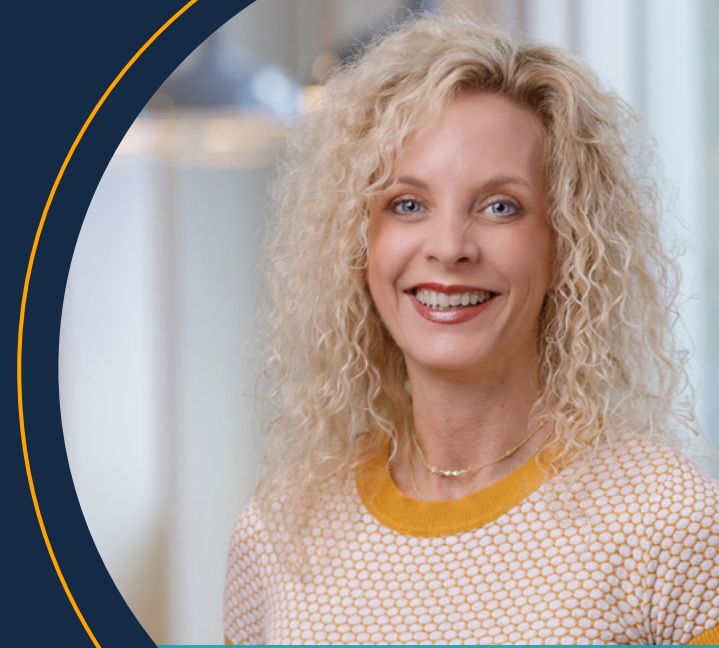
Sunshine ACT Care Coordinator

Please see additional Important Safety Information throughout and the full Prescribing Information for RELYVRIO.